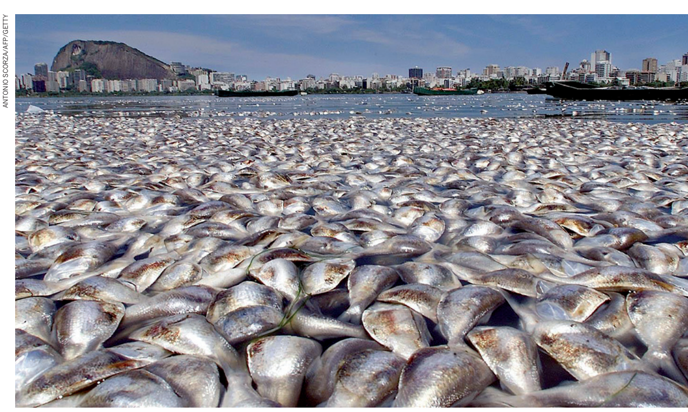
The shores of Rodrigo de Freitas Lake in Brazil are littered with fish killed by algal overgrowth in March 2000.

FUNDING US science agencies still worried about deferred spending cuts p.163