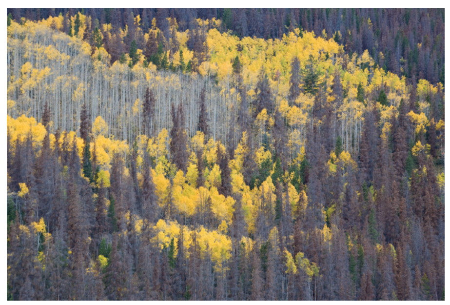
Forests in Colorado are being pushed towards collapse by pine-beetle infestations.

of the dust and atmospheric gas in ice cores) and the onset of epilepsy (signalled by a sudden change in the electrical activity of the brain).